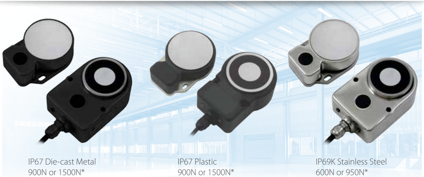
IP67 Die-cast Metal 900N or 1500N*

D40ML Magnetic Locking Safety Switch with RFID Technology